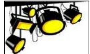
Spotlight on a Republican Club business supporter:

We have two new supporters in this issue.